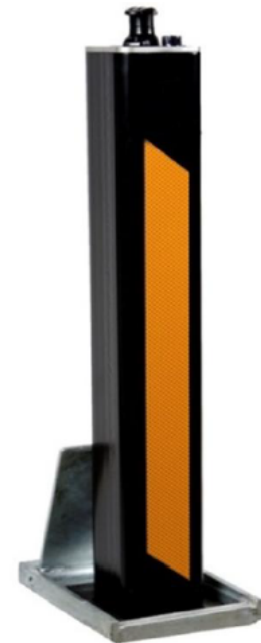
90 Square Fully Retractable Bollard